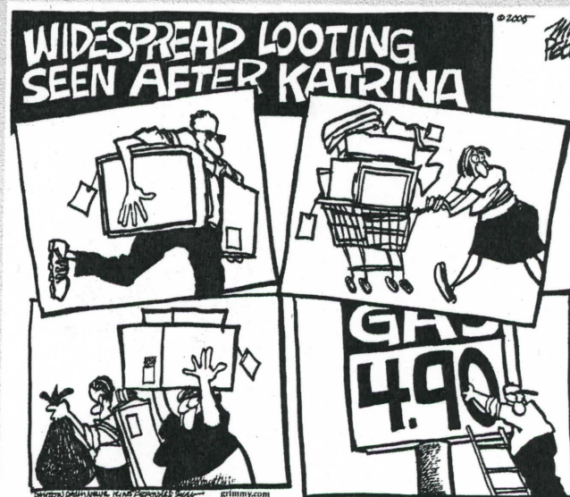
MIKE PETERS—DAYTON DAILY NEWS/ING FEATURES SYNDICATE

For more political humor, visit time.com/cartoons